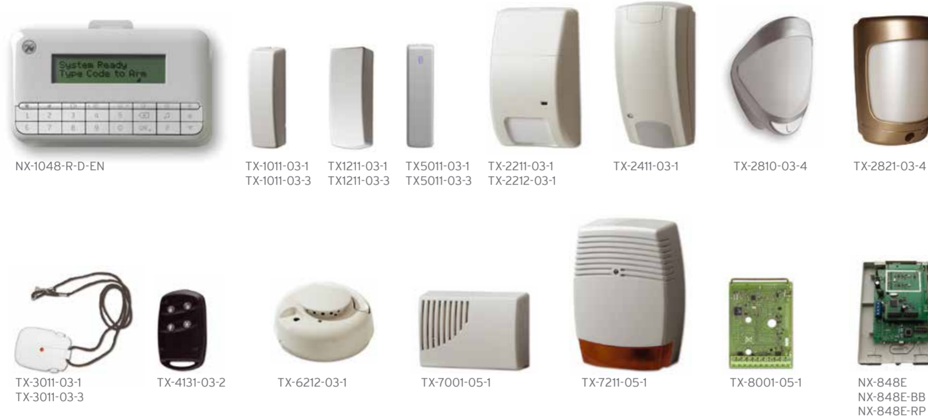
NX-1048-R-D-EN TX-1011-03-1 TX-1011-03-3 TX-1211-03-1 TX-1211-03-3 TX-5011-03-1 TX-5011-03-3 TX-2211-03-1 TX-2212-03-1 TX-2411-03-1 TX-2810-03-4 TX-2821-03-4 TX-3011-03-1 TX-3011-03-3 TX-4131-03-2 TX-6212-03-1 TX-7001-05-1 TX-7211-05-1 TX-8001-05-1 NX-848E NX-848E-BB NX-848E-RP