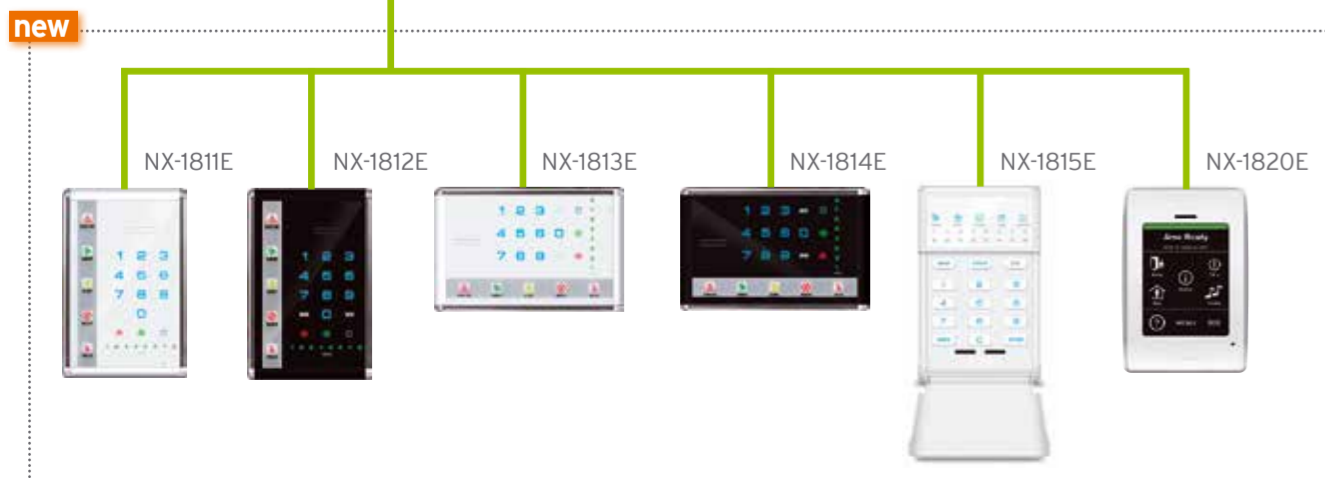
NX-1811E NX-1812E NX-1813E NX-1814E NX-1815E NX-1820E